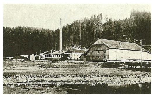
Glass factory in Putna