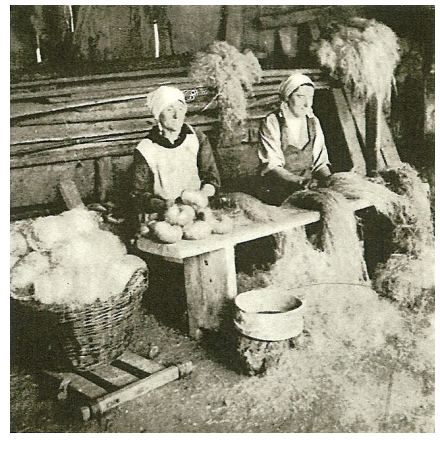
German women combing hemp in Tereblestie